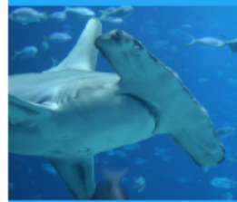
School of Hammerhead Sharks